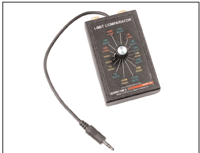
Figure 4. Semtronics 62080 Limit Comparator

The Semtronics Limit Comparator allows the customer to perform NIST traceable calibration on a number of Semtronics Testers including the 62101, 62102, and 62104. The Limit Comparator can be used on the shop floor within a few minutes virtually eliminating downtime, verifying that