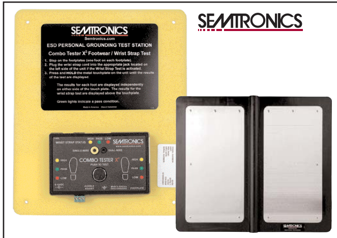
Figure 1. Semtronics Dual Independent Footwear and Wrist Strap Tester (EN752) and Dual Foot Plate