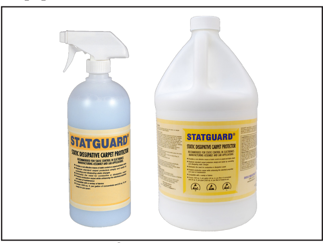
Figure 1. Statguard<sup>®</sup> Carpet Protector, 1 Quart (0.95 Litres) spray trigger ready to use for dry application; 1 Gallon (3.8 Litres) concentrate