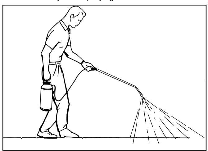
Figure 2. Compressed air sprayer in use.

To obtain the best performance from Statguard<sup>®</sup> Carpet Protector, work the product into the carpet immediately after spraying.